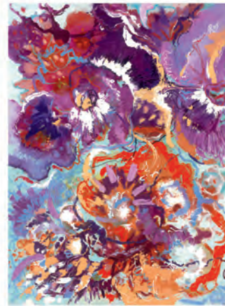
LIVING IN THE MOMENT, Acrylic, Oil, and Pigment Stick, 48"x36"x1.5" Gallery Wrapped Canvas