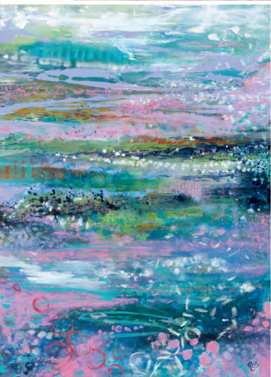
CANDYLANDSCAPES, Mixed Media, 48"x36" Gallery Wrapped Canvas